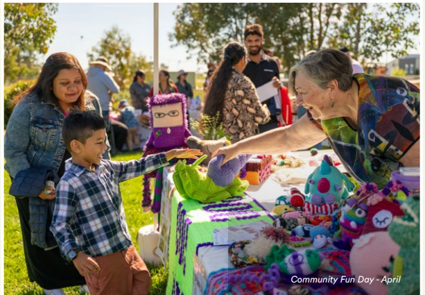
Community Fun Day - April