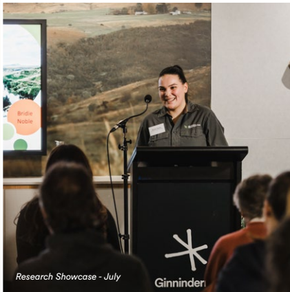
Research Showcase - July