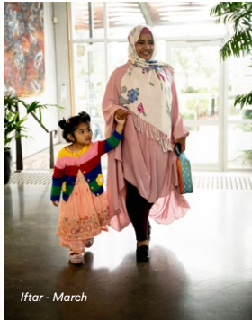
Iftar - March