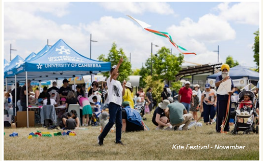
Kite Festival - November