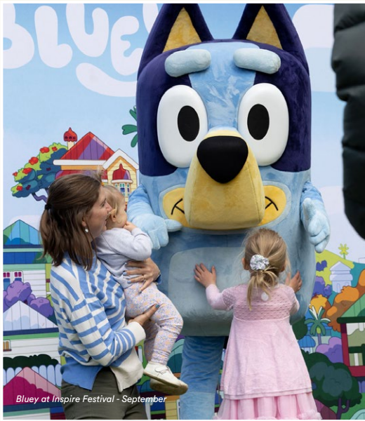
Bluey at Inspire Festival - September