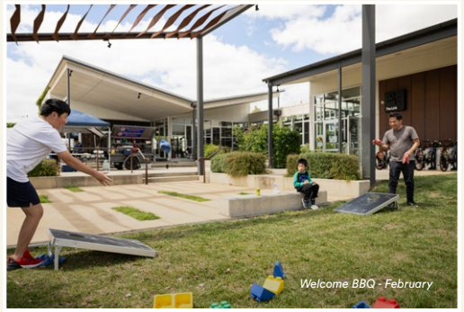
Welcome BBQ - February