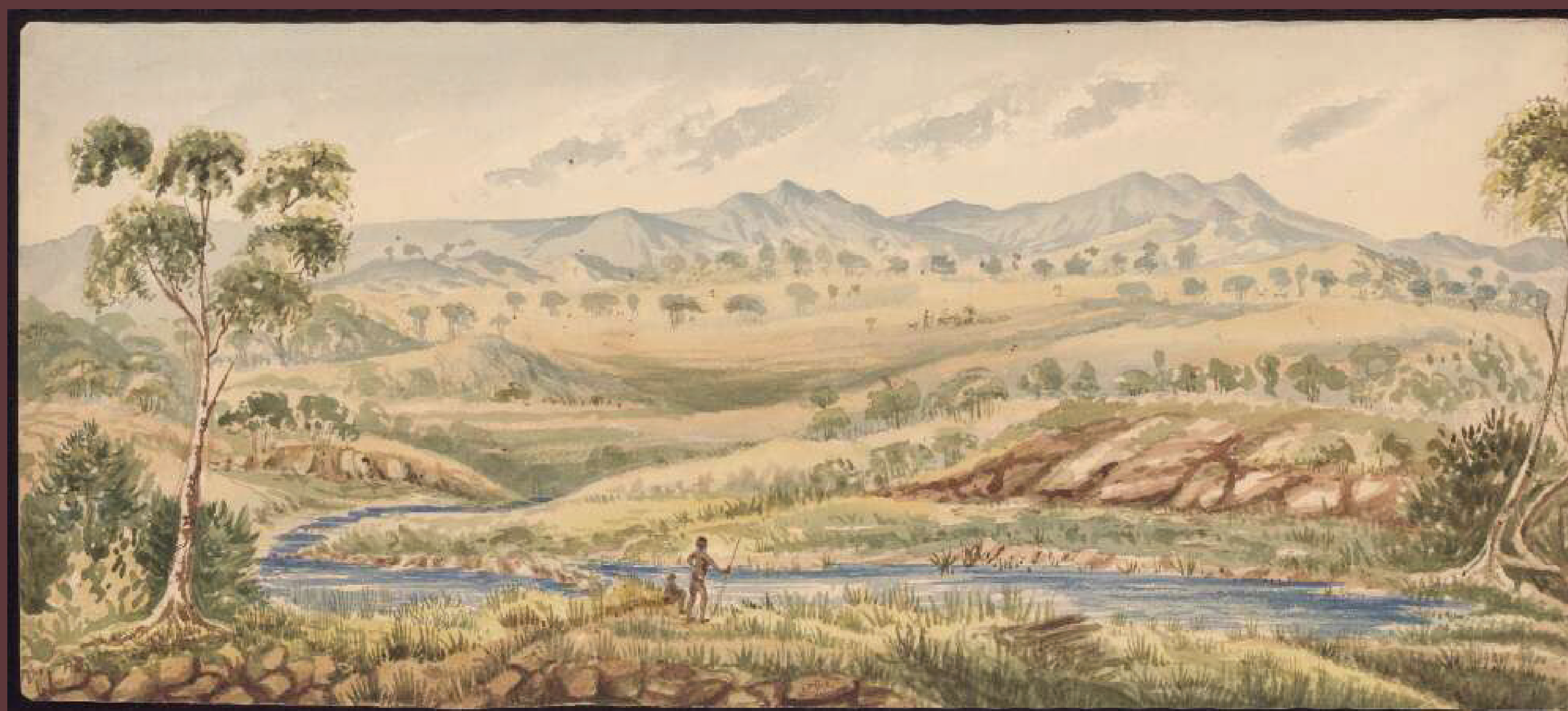
Robert Hoddle, 1832, 'Ginninginderry Plains, New South Wales'. Watercolour painting; 18 x 41.7 cm.