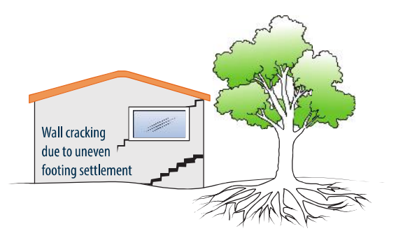
FIGURE 1 Trees can cause shrinkage and damage.

Roots in the vicinity of footings will absorb much of the moisture in the foundation soil, causing shrinkage or subsidence.