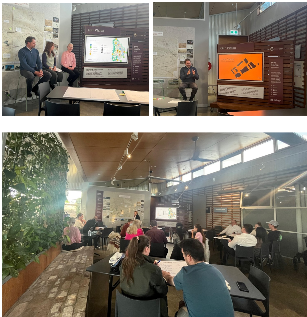
Images from the November 1 workshop.

Ginninderry will use feedback from this workshop to guide continued engagement and communication with residents.