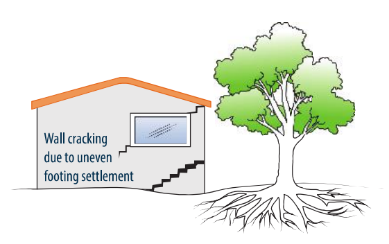
FIGURE 1 Trees can cause shrinkage and damage.

Roots in the vicinity of footings will absorb much of the moisture in the foundation soil, causing shrinkage or subsidence.