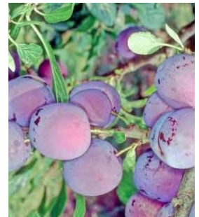
Prunus salicina - fruit