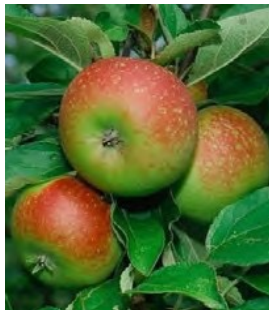
Malus domestica – fruit