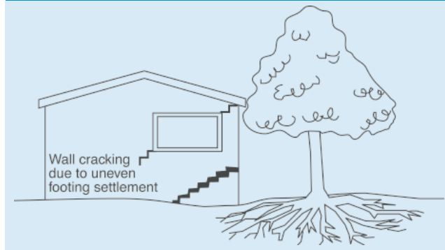
Trees can cause shrinkage and damage

As the weather pattern changes and the soil begins to dry out, the external footings will be first affected, beginning with the locations where the sun's effect is strongest. This has the effect of lowering the external footings. The doming is accentuated and cracking reduces or disappears where it occurred because of dishing, but other cracks open up. The roof lines may become convex.